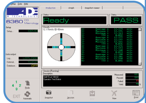
6360 CD System Software showing thickness scan data