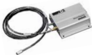
Nanometer Resolution Precision Position Sensor