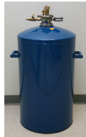
Liquid Nitrogen Dewar

The N2 DEW option includes a 50 liter liquid Nitrogen Dewar and an adaptor to use this Dewar with the EV1-LHE option. Also included are a rolling base for the Dewar and a power supply and heater element to slowly boil-off the liquid nitrogen to provide pressure and gas for the cryostat.