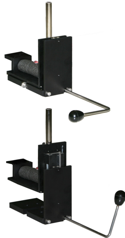
Figure 1. The temperature chamber is mounted on a slide that allows the user to bring the chamber in place in seconds when needed and move it out of the way easily to quickly change samples.

Also, all temperature systems except for the EV1-HE and the EV1-Cryocool system, require no vacuum pump system. The EV1-HE system requires only occasional pumping of the transfer line for best system performance.